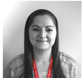
Jodie Vines Technical Services

FAI pumps are supplied ready to fit with the relevant gasket but if you or your customer are ever unsure then we're here to help .